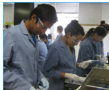
PEERS students participating in the Biomedical Sciences Enrichment Program in summer 2014.

Apply in the fall for a $2,000 award to do research in the winter and spring quarters