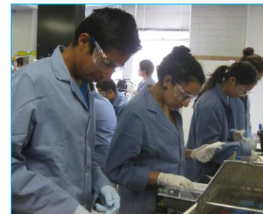
PEERS students participating in the Biomedical Sciences Enrichment Program in summer 2014.

Apply in the fall for a $2,000 award to do research in the winter and spring quarters